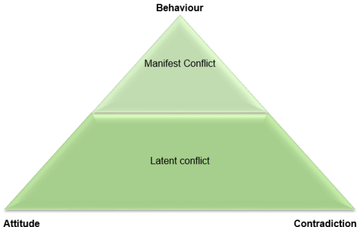
Figure 1.1: The ABC triangle of Conflict.