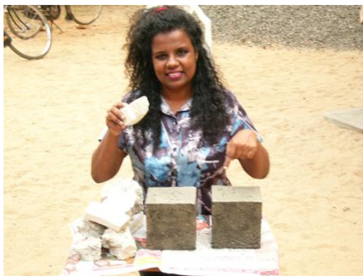
The Author displaying the concrete blocks made from Tsunami debris

The author displaying the cement blocks made from recycling the debris. When tested these blocks have a higher strength than the normal cement blocks. The strength of the blocks were tested in the laboratory of the civil engineering department, Ampara