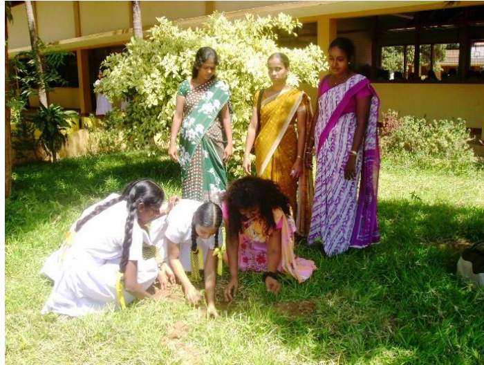
School children planting trees following an awareness program