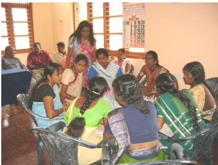
The Author teaching a group of community workers in Vavuniya

The author in addition also conducted awareness programs on the importance of keeping the refugee camps clean and commenced a program for beautification of the refugee camp surroundings. Even though it was a painful experience to see many persons from all walks of life crowded within a small camp, being able to work with them to bring about changes to their surrounding gave comfort for them to know that they were cared for. In most travels to Vavuniya there were incidences of bombing close to the place of residence. In fact on some occasions bombs fell close to Veppumkulum, where the compost plant was situated. People of Vavuniya were grateful that a Sinhalese woman travelled often from Colombo to Vavuniya to create awareness and bring a lasting solution to the growing garbage problem. Without a word being said on peace or reconciliation better understanding was establishing between this one Sinhalese woman and those who came in touch with her in the district of Vavuniya.